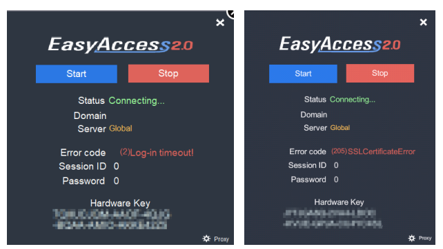
Figure 2. Error code 2 or 205 may be shown on the HMI (template window 76).

The root CA certificate used by older EasyAccess 2.0 clients (versions below 2.16.4) expires on August 12, 2023. After that, these clients will not be able to successfully connect to the EasyAccess 2.0 servers and will product either error code 2 (Log-in timed out) or 205 (SSL certificate error) at EBPro register LW-10829/System Setting/EasyWeb, as shown in Figure 2 to 4.