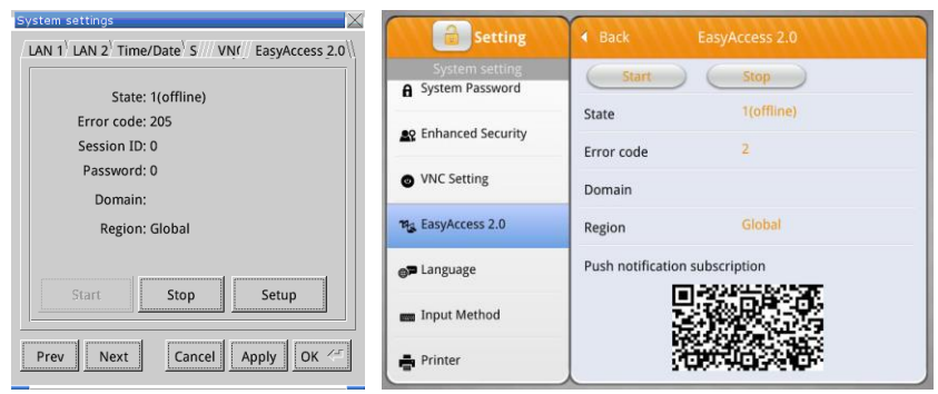
Figure 3. Same error code can be seen in the system setting.